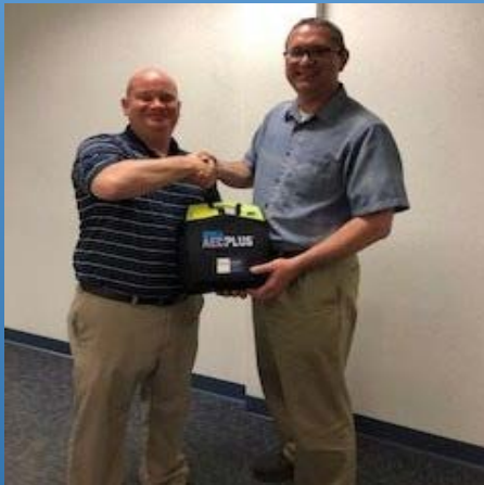
Pulse 3 AED Donation on May 30, 2018