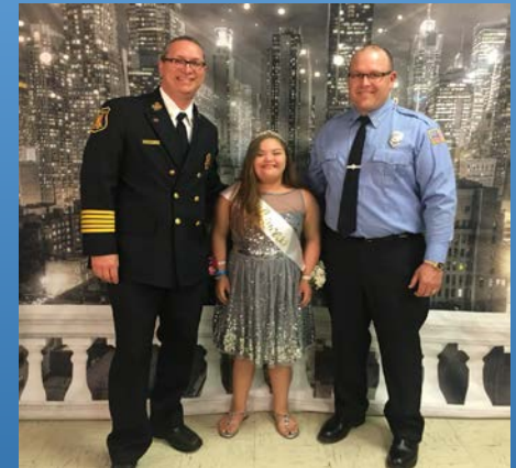
2018 Prom In the City Special Needs Prom