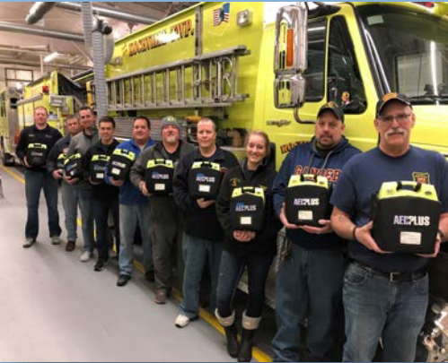
All members have been provided with Automatic External Defibrillators (AED) for their personal vehicles