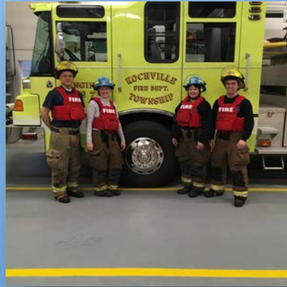
Purchased 4 bullet proof vests to respond to hostile situations