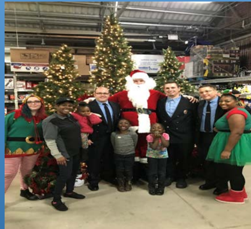
2018 Shop With A Hero at Wal-Mart