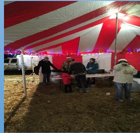
2018 Christmas in Kochville

Reducing risks to our businesses is the primary responsibility of our fire inspector. Currently we have employed one full time Fire Inspector that performs a variety of tasks that include fire inspections, re-inspection, plan reviews, and is also responsible for permitting on all life safety systems. In 2018, our Fire Inspector performed 188 fire inspections, 291 re-inspections, and 73 plan reviews.