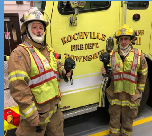
We upgraded all of our Thermal Imaging Cameras and now each engine is provided with a Thermal Imaging Camera