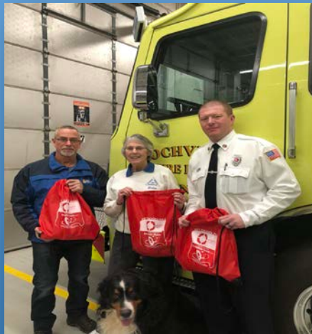
We received a donation from The Invisible Fence Company & The Tri Cities Dog Training Club for Per Resuscitation Equipment